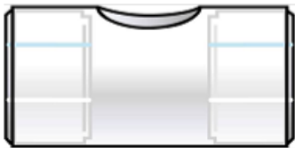
ThermoFlo™ Trach Basic

Humidification: 26mg H 2 O/L air, 500 V T Resistance: 0.25cm H 2 O @ 30 LPM Dead Space: 12 ml