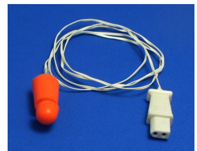
400-TY Tympanic Temperature Sensor