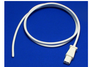
4009-ER General Purpose

Reduce the number of direct patient contacts and need to change PPE by not entering the patient room for monitoring that can be done remotely. Rather than intermittent temperature monitoring, why not use a continuous electronic temperature probe and plug it into the multi-parameter patient monitor? The reading is more accurate and it reduces the patient contact intervals thereby reducing the risk of direct contamination and subsequent cross contamination from the intermittent temperature device and/or healthcare provider. Skin, tympanic, and general purpose (nasal/rectal) temperature sensors are ideal for continuous temperature monitoring in the ICU's and other units with rooms equipped with patient monitors. Transport monitors can also be placed in unequipped rooms to allow for continuous monitoring.