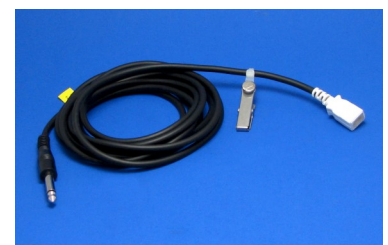
C400MP-M Connecting Cable