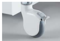
SINGLE-WHEEL SHROUDED CASTER