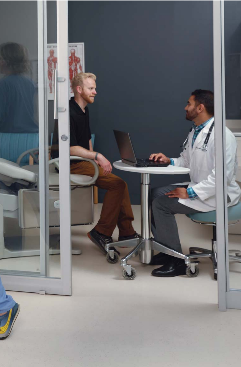
PICTURED ABOVE H Class Kidney Laptop Cart – MPC-43P (Cloud) Single-Wheel Rollerblade Casters