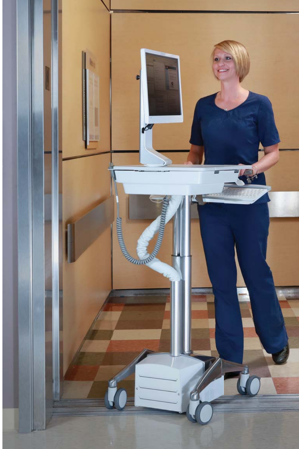
PICTURED ABOVE Clio LCD Cart – C3 (Cloud) Dual Wheel Casters

We study clinicians' everyday workflow and healthcare environment challenges. Our unique workstation solutions provide clinicians with ease of mobility and effortless adjustments. Accessing technology at anytime and anywhere, working safely within different healthcare environments, and enhancing productivity are just some of the ways our mobile technology workstations are improving clinician efficiency and physical comfort.