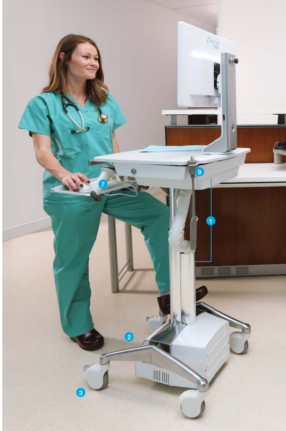
PICTURED ABOVE Clio LCD Cart – C3 (Cloud) Single-Wheel Shrouded Casters

To assist in promoting a healthy work environment, it is essential to have a technology workstation that considers human factors and adjusts to each unique clinician. Our products meet or exceed the ability to adjust to fit each caregiver.