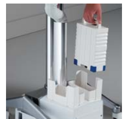
CLIO PLUS BATTERY