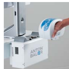
CLIO SWAP BATTERY