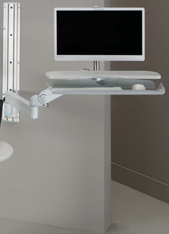
REACH Independent LCD Swivel Workstation RCLS-32-WKS-EX (Cloud)