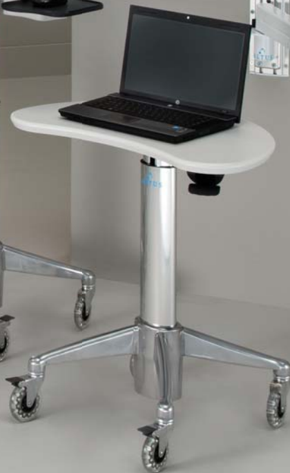
H Class Kidney Laptop Cart MPC-43P (Cloud)