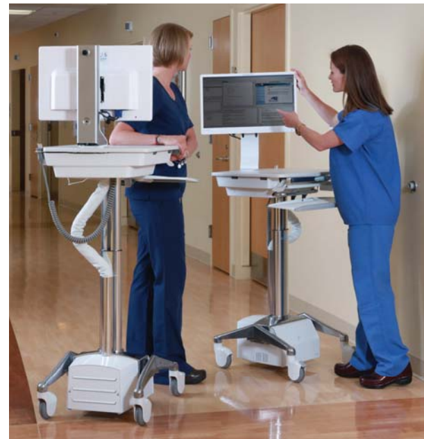
PICTURED ABOVE Clio LCD Cart – C3 (Cloud) Single-Wheel Shrouded Casters

Clio Plus is a flexible, hybrid system that can utilize either swappable-power through swapping a depleted battery for a fully charged battery or wall outlet power through on-board charging.