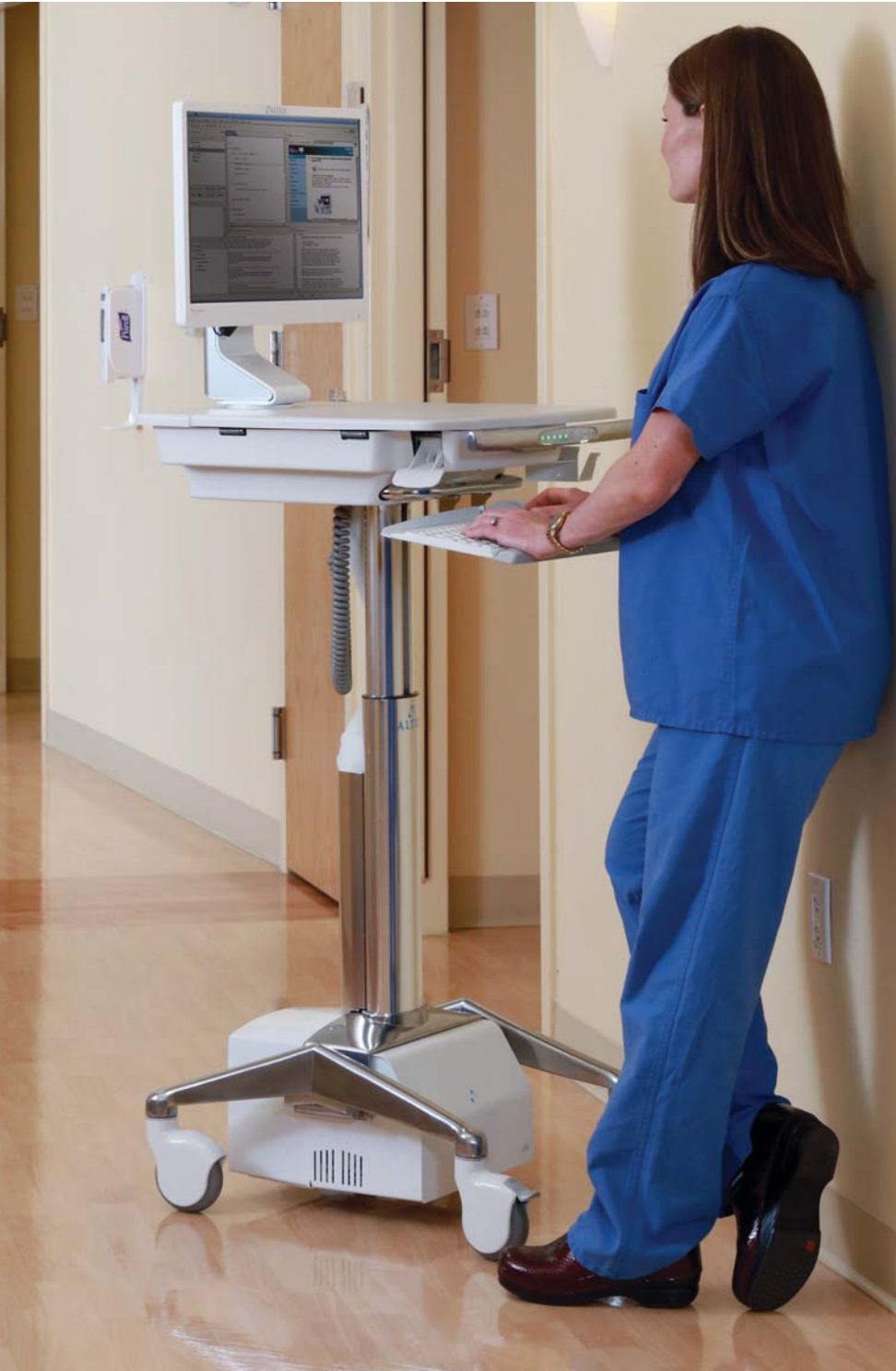
PICTURED ABOVE Clio LCD Cart – C3 (Cloud) Single-wheel Shrouded Casters

Clio Swap is a swappable-power cart system. Electrical power is renewed by swapping a depleted battery for a fully charged battery. The 3.6 lb. battery makes it easy for caregivers to install or remove with one hand.