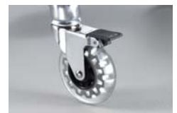
SINGLE-WHEEL ROLLERBLADE CASTER