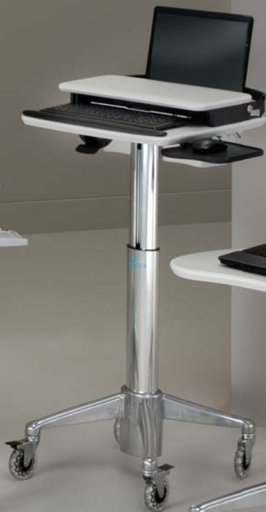
H Class Laptop Cart HLC7P2 (Cloud)