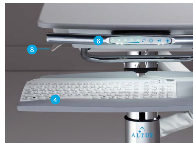
PICTURED ABOVE Clio LCD Cart – C3 (Cloud) Single-Wheel Shrouded Casters