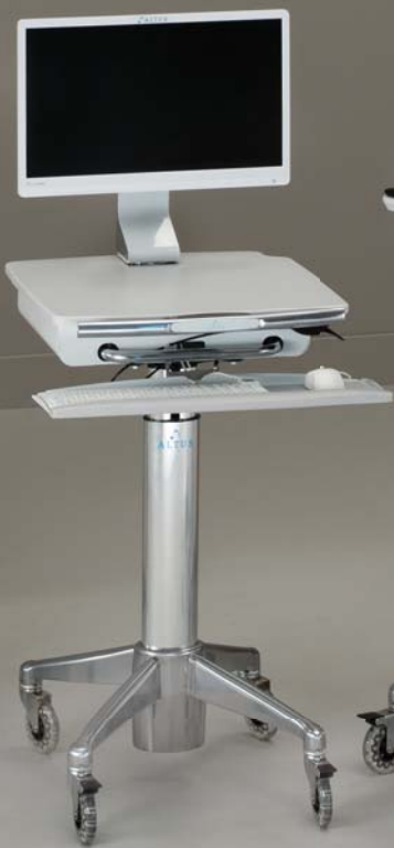
H Class LCD Cart HHC8P (Cloud)