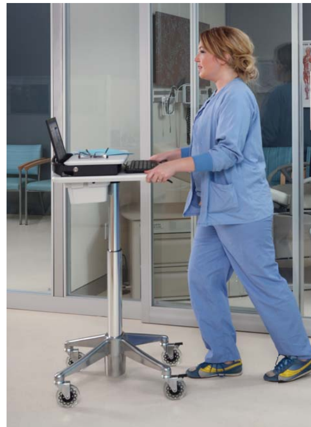
PICTURED ABOVE H Class Laptop Cart – HLC7P2 (Cloud) Single-Wheel Rollerblade Casters