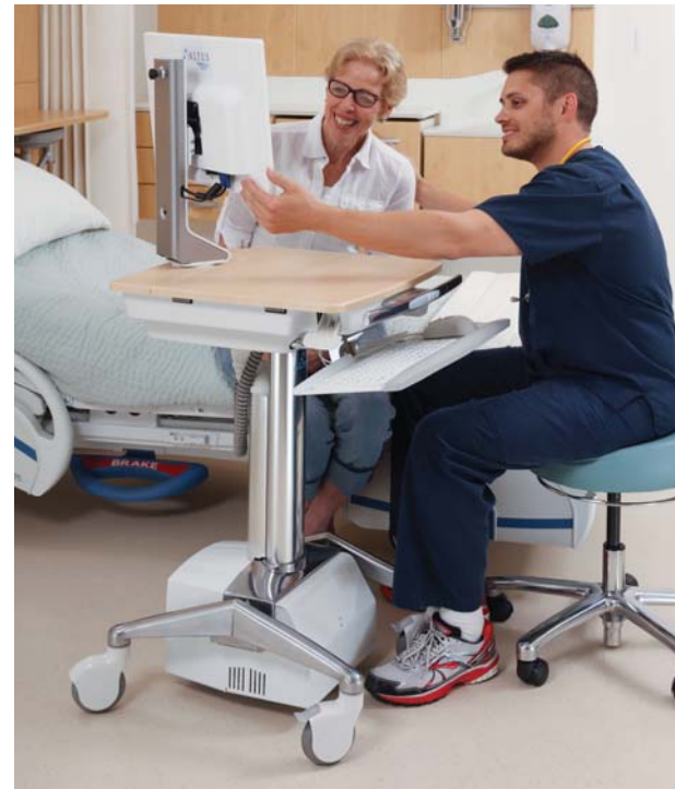
PICTURED ABOVE Clio LCD Cart – C3 (American Natural Maple) Single-Wheel Shrouded Caster