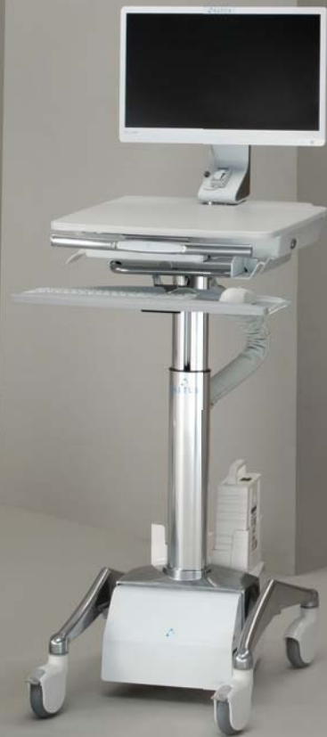
Clio Swap LCD Cart C7 (Cloud)